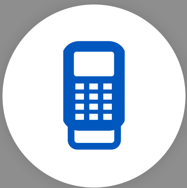
MERCHANT CASH ADVANCE